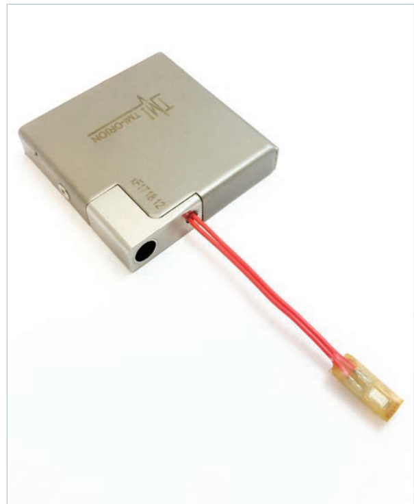
NanoVACQ xFlat 1Td