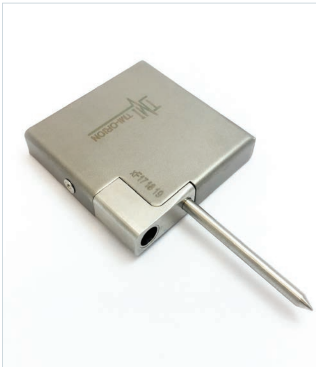
NanoVACQ xFlat 1Tc